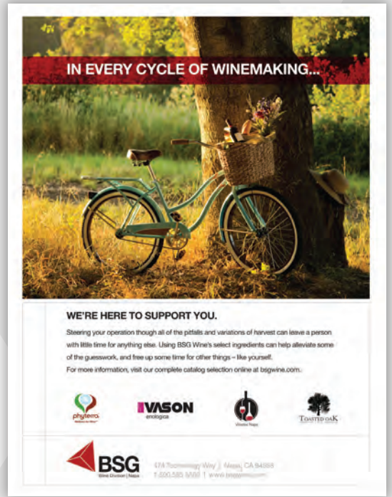
Full Page no Bleed 7" x 10"