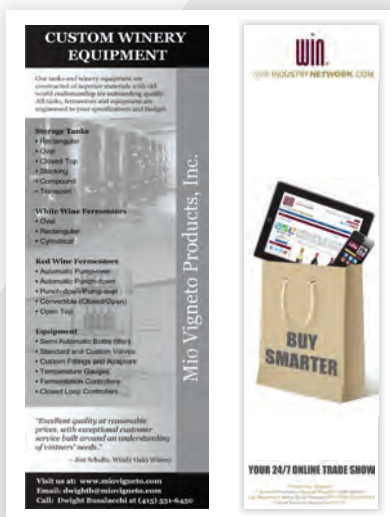
Vertical 1/3 Page 2 1/8" x 9 3/4"