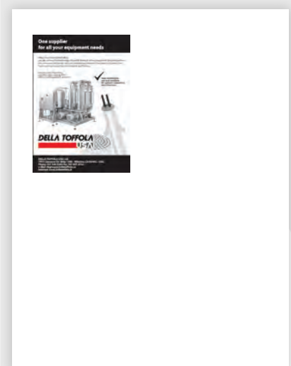
1/4 Page 3 1/2" x 5"